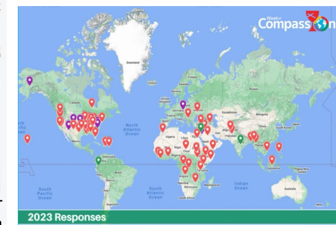
Map of the geographic locations that were blessed by the donations given during the Week of Compassion in 2023.